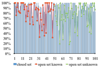
Fig. 3. The comparison between the closed-set and open-set recognition for each category.